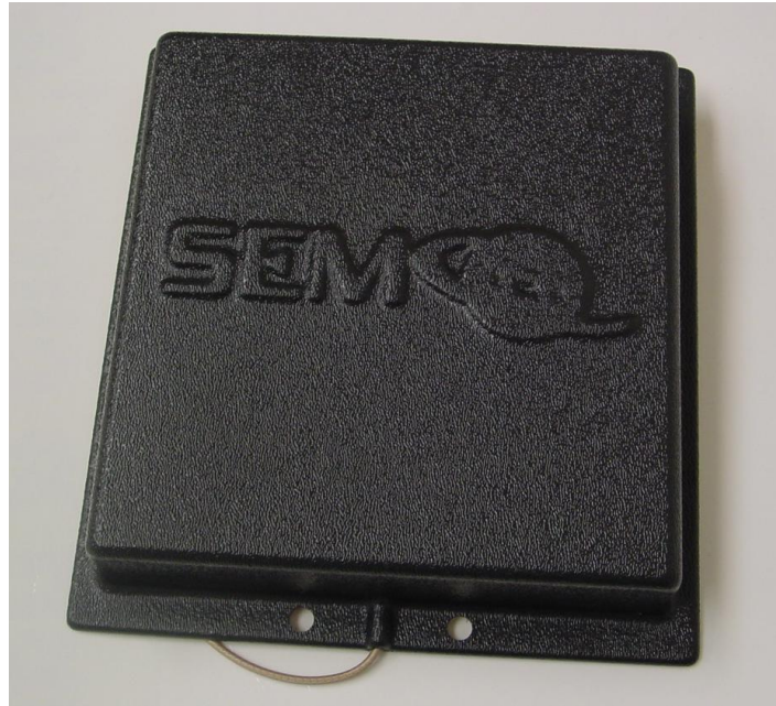
Figure 8 Dual Band Antenna

The P270 comes with a directional high gain (12 dB), dual band antenna. See Figure 8. This antenna is connected via the side panel. See Figure 9.