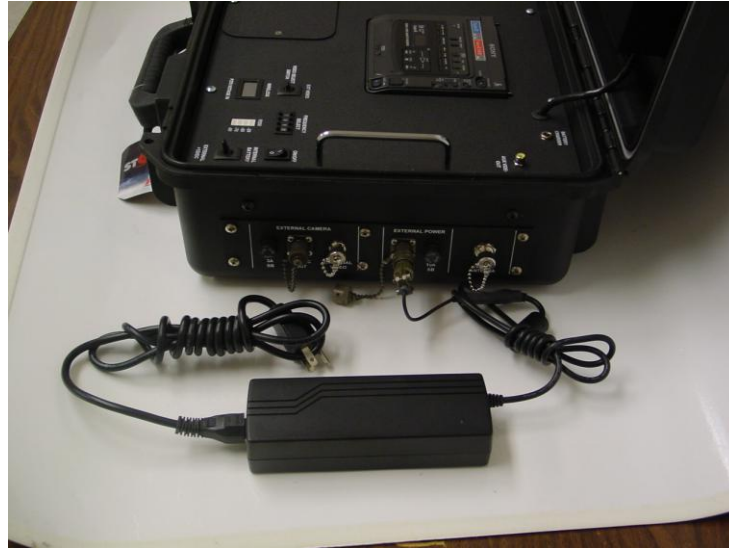
Figure 4 External Power Adapter

CAUTION: DO NOT OPERATE THE SYSTEM FROM THE INTERNAL BATTERY WHILE SIMULTANEOUSLY CHARGING THE BATTERY.