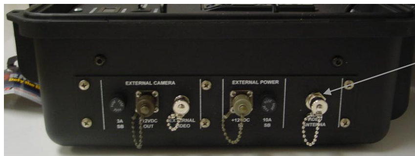
Figure 9 Antenna Connector