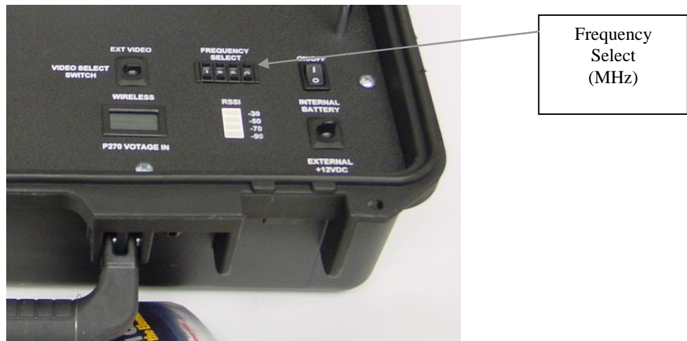
Figure 5 – Frequency Selection

The P270 receiver is a dual band (L-band and S-band) receiver that operates in the frequency bands between 1710-1850 MHz and 2185-2485 MHz. In order to select the desired frequency of operation, the user inputs the frequency in MHz via the Frequency Select rotary switches. Each switch toggles between values 0-9. Simply adjust the switches to read the desired frequency. See Figure 5.