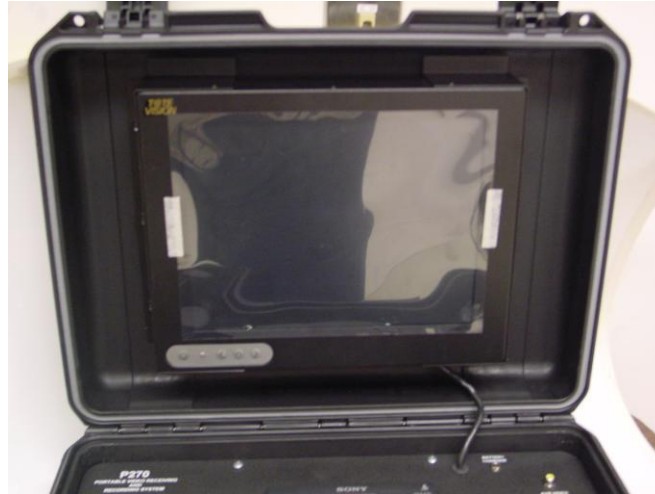
Figure 6 Video Monitor.

The P270 has an integrated video monitor for display of video. See Figure 6. Wireless video from the internal microwave receiver or an external video input can be displayed on the monitor. In order to select the video source, the user selects either WIRELESS (for receiver video) or EXT Video for an external video source. The external video source will be input via the side panel connectors. A separate 12VDC output is also available to power the external video source, if necessary. See Figure 7.