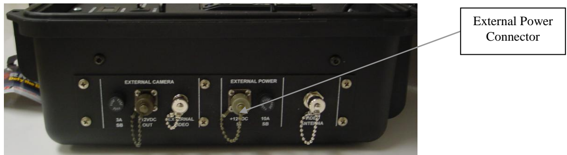
Figure 3 External Power Input Connector

If the External Power Adapter is to be used to power the P270, connect the supplied 115VAC/12VDC power adapter to the External Power Connector as shown in Figure 4. The system can be powered on at this time.