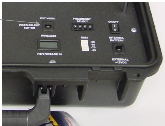
Figure 7 Video Source Selection